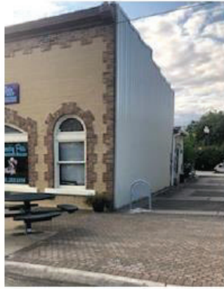
Bike repair station located at the head of the Heartland Trail in town. Wave bike rack downtown. 4 smaller decorative bike racks through our downtown.