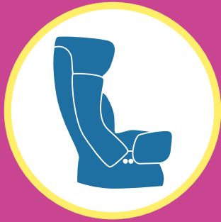
Forward-facing 2-5 years