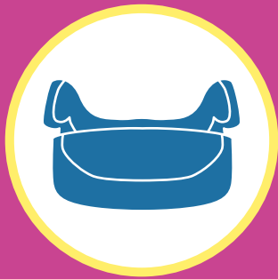
Booster seat 5-8 years or until 4' 9"