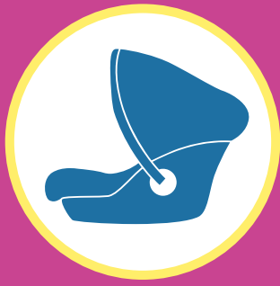
Rear-facing 0-2 years