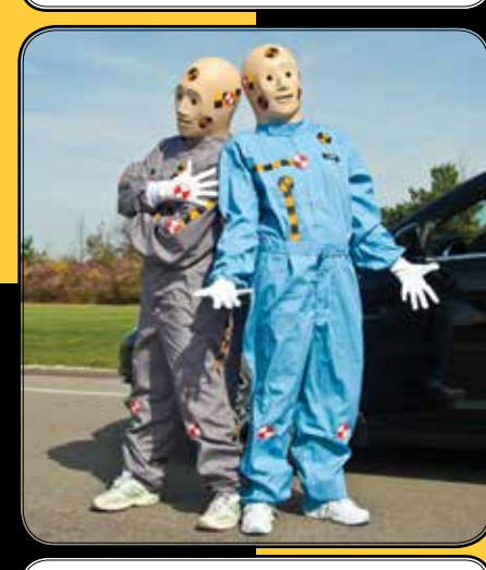
The Crash Test Dummies