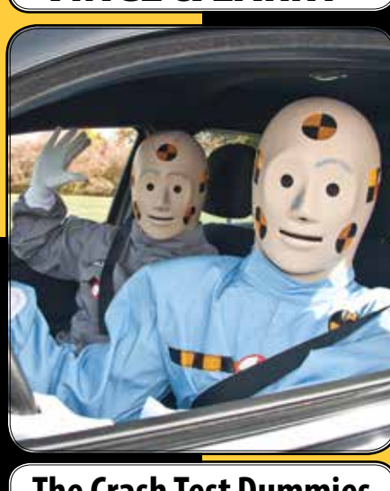
The Crash Test Dummies