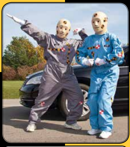
The Crash Test Dummies