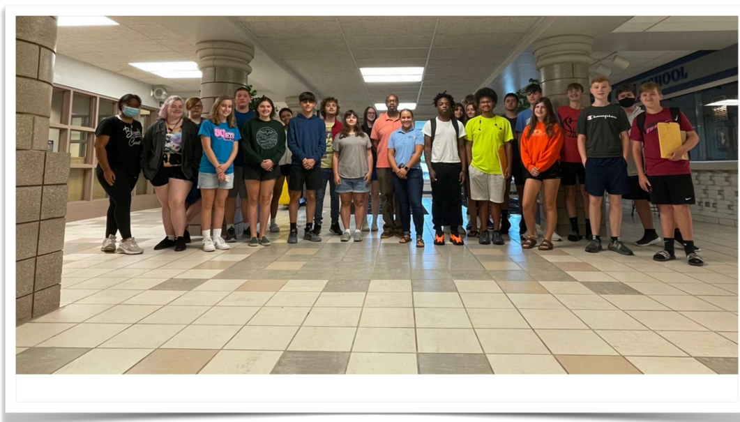
Michigan Driving School at Lakeview High School