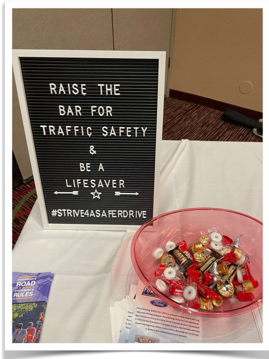
SEPLA Conference with 90 School Resource Officers (RSO's)