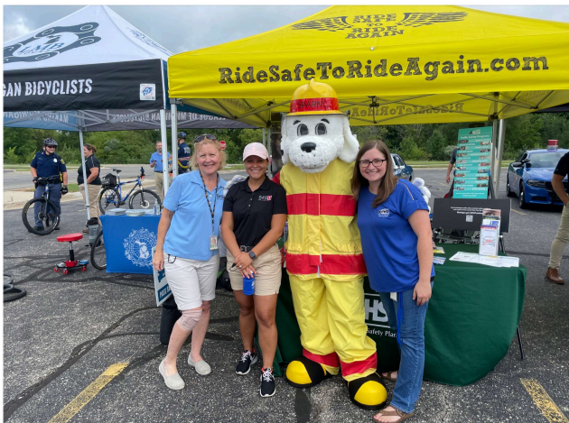
OHSP, S4SD, and of course, Sparky take on Safety Day at MSP Headquarters