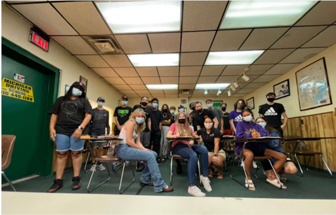
Michigan Driving School at the Roseville, MI location