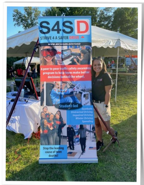
National Night Out hosted by the Flint Township Police Department