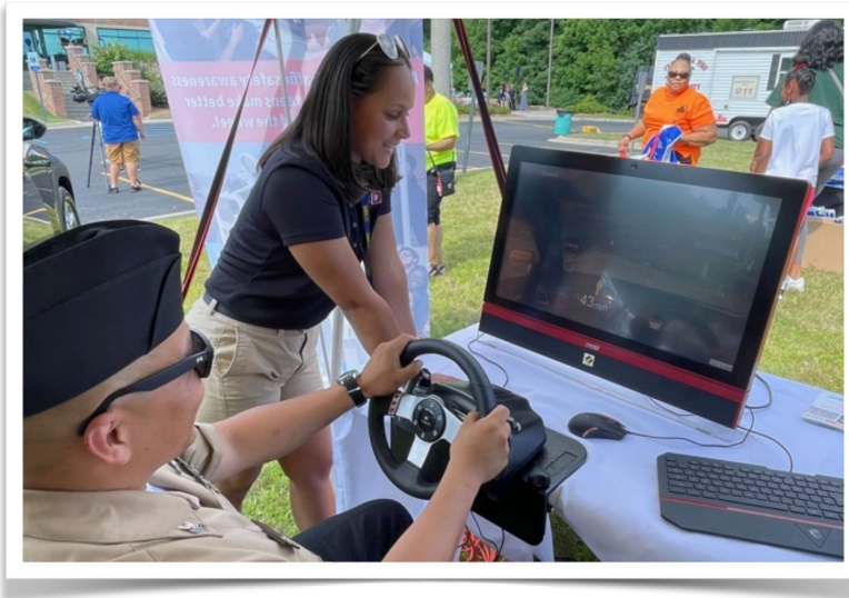
National Night Out hosted by the Flint Township Police Department