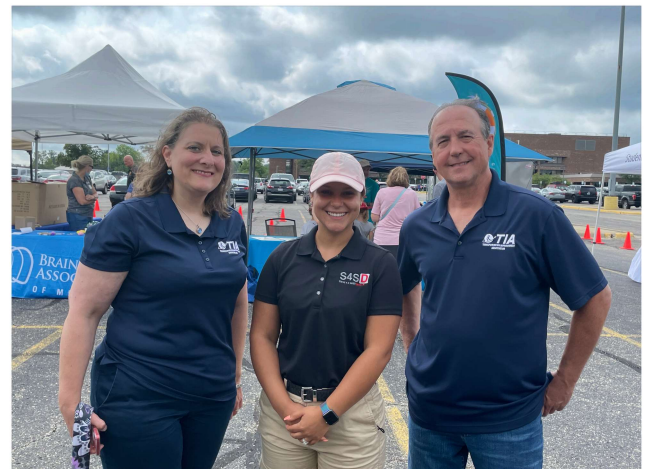
TIA's engineering department in support of Safety Day