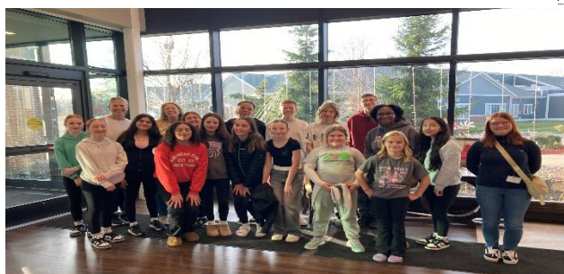
Bingo with Middle School East NJHS