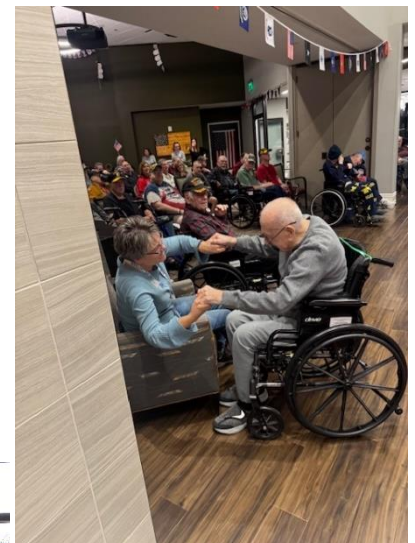
Veterans Day Party