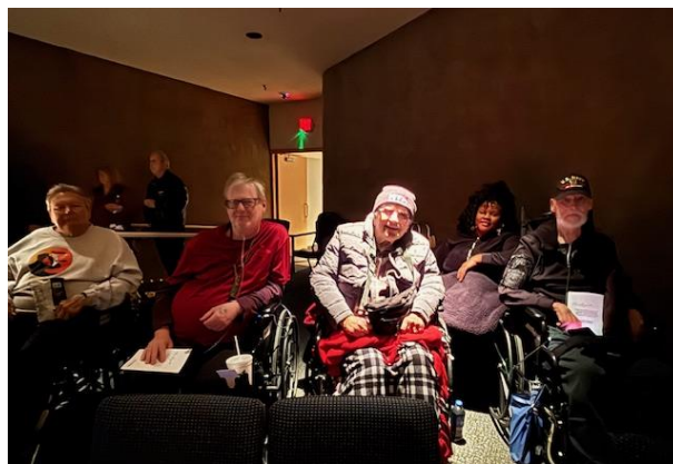
Macomb Center for the Performing Arts