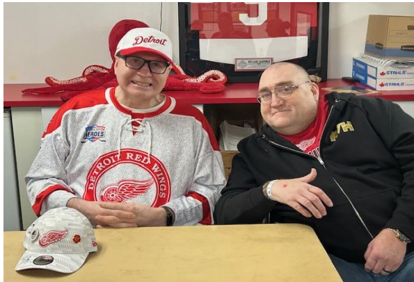
Red Wings Alumni Game

November was a month full of honor, recognition, and celebration. None of it would be possible without the unwavering support of our community, our dedicated volunteers, and the wonderful organizations whose mission is to support the men and women who call MVH Chesterfield home.