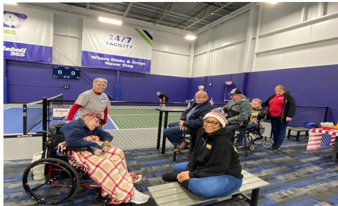
Pickleball 365 Salute & Swat Tournament