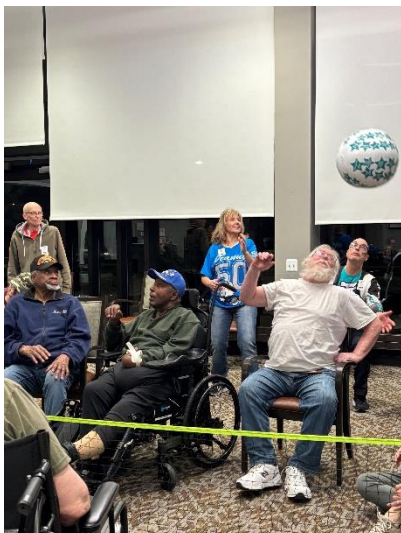
Volleyball in the MMR