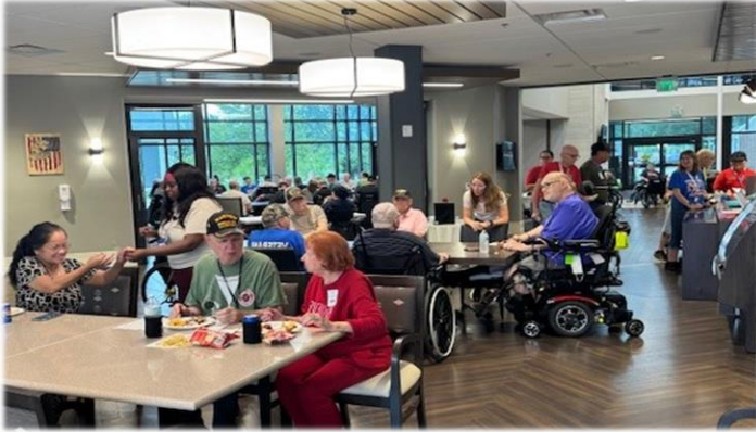
Fish Fry with the Fallen Outdoors

That's a wrap, August flew by! Our members spent the month enjoying summertime festivities before the warm air turns into a crisp chill and the seasons do their thing in our beautiful state.