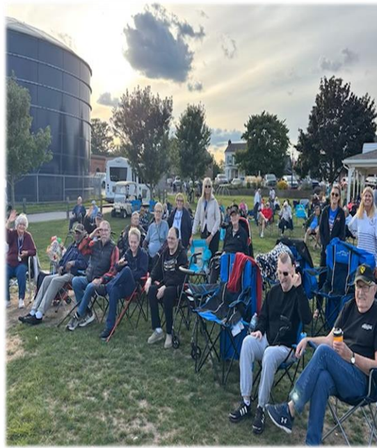
Concert in the Park