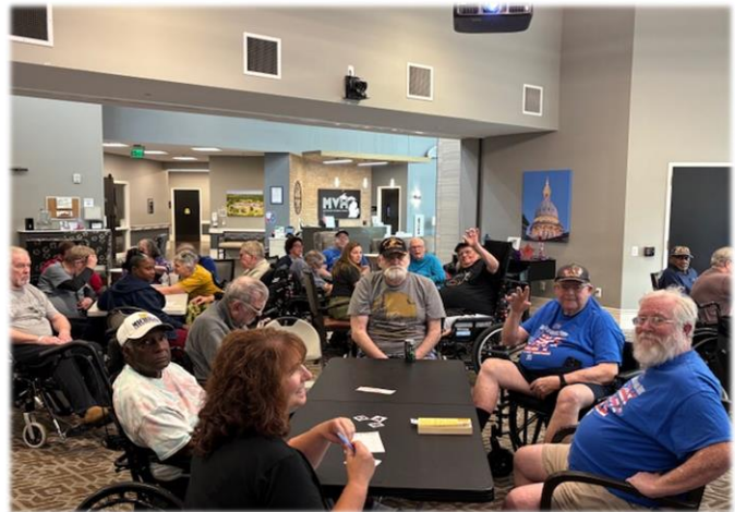
DJ Trivia Night