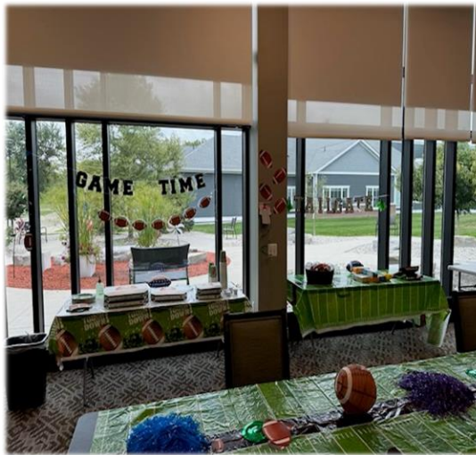
Fantasy Football – Draft Day