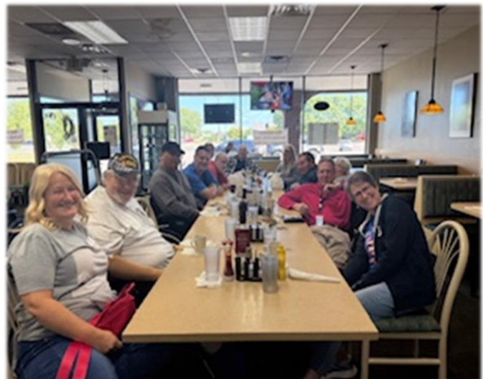
Breakfast at Alexander's