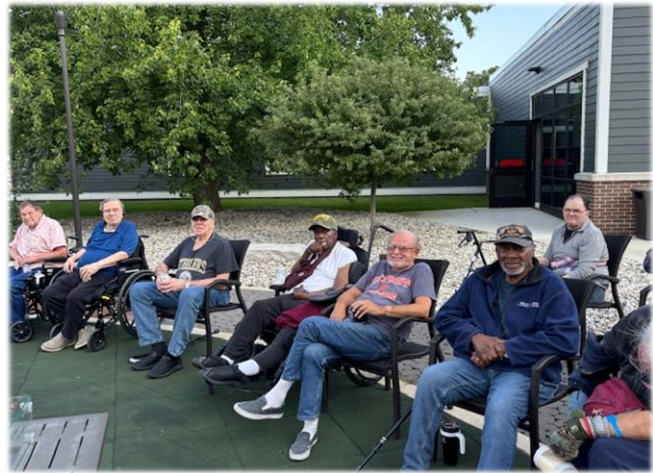
Bonfire on the Patio