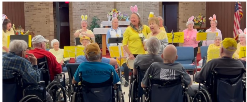
The Sunshine Girls always bring the fun!