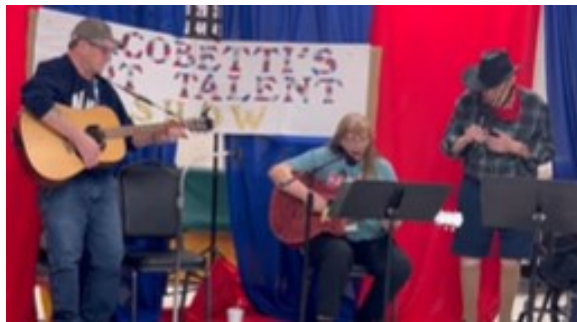
Our 2025 Talent Show was INCREDIBLE!!!! Check out our Facebook page for photos and video.