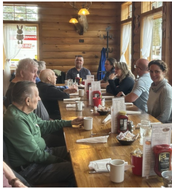
Great company and lunch with Select Realty at The Up North Lodge