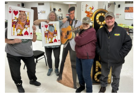
Our Veteran Facility Coordinators (VFC) sponsored Vegas Days (one HOT hour of blackjack) and 4 of our VFC Reps volunteered as dealers or helpers!