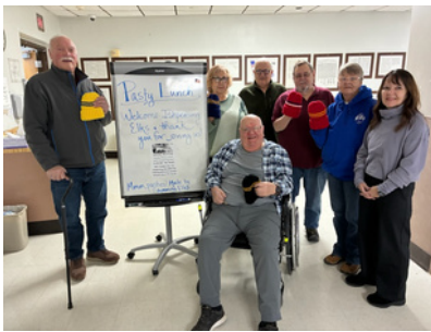
Members of the Ishpeming Elks brought pasties, knit hats and fun!

On behalf of our veteran members, their loved ones, and our staff, thank you. Thank You. THANK YOU!