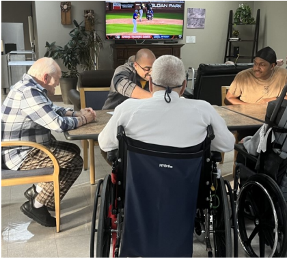
Game Night was fun with NMU Black Student Union Members