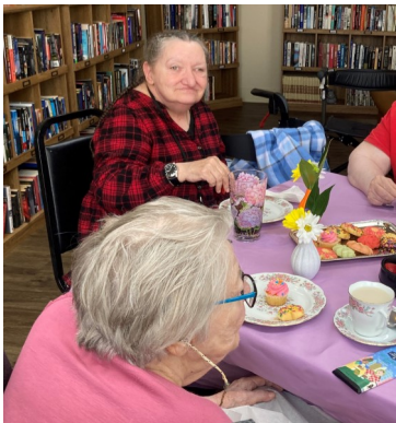
Our Ladies Tea Party brought our 5 female members together (and a couple family members too) for tea, sweets, and conversation!