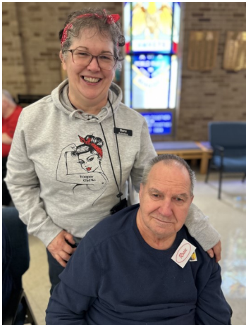
We celebrated National Rosie the Riveter Day! For more photos go to www.facebook.com/MiVeteranHomesDJJ/