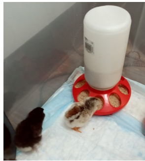
We incubated and hatched chicks!