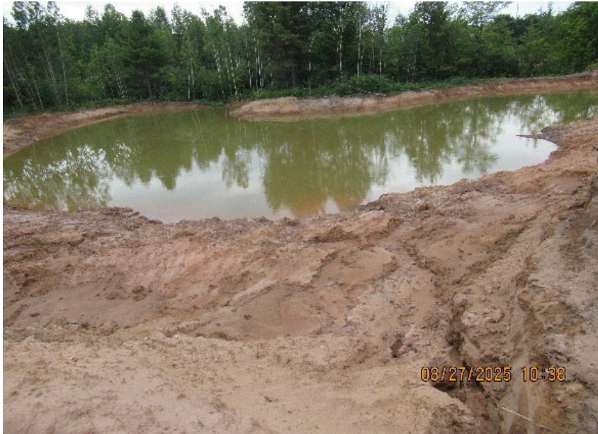
West Pond in Progress 8/27/2025