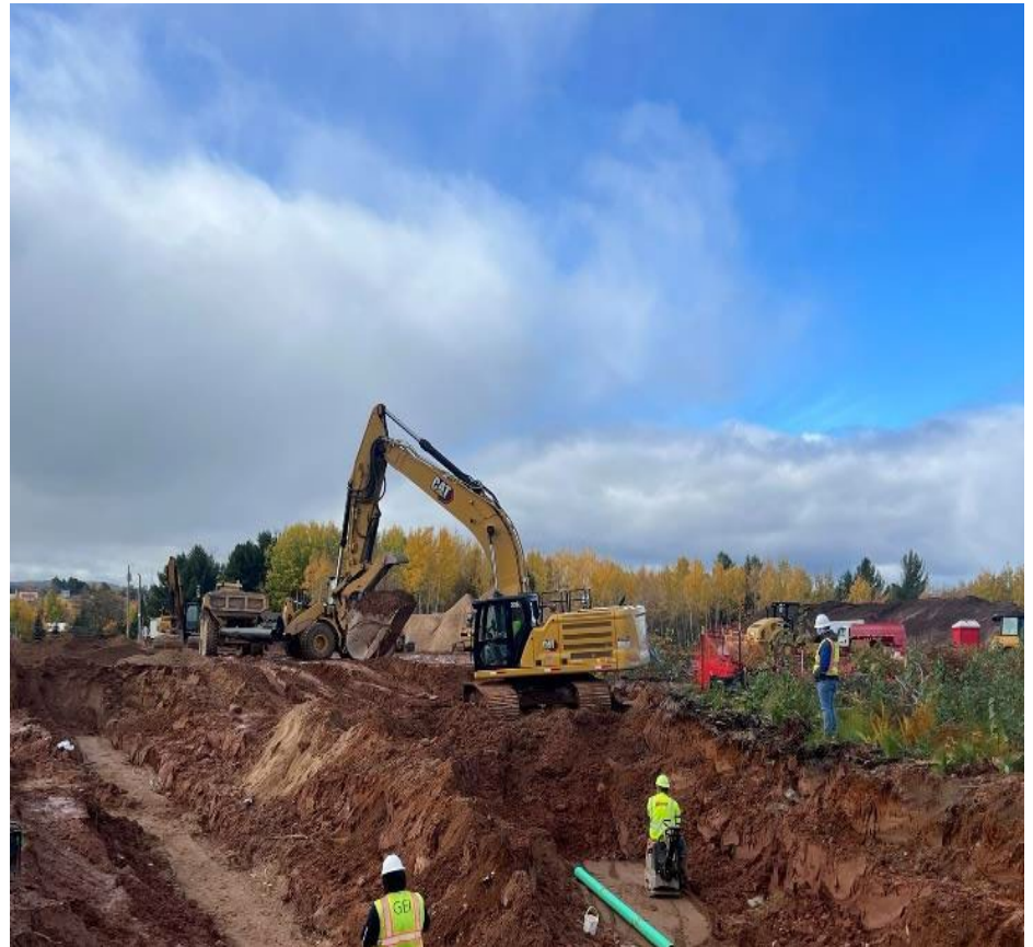
Water Main Pipe installation 10/24/2025