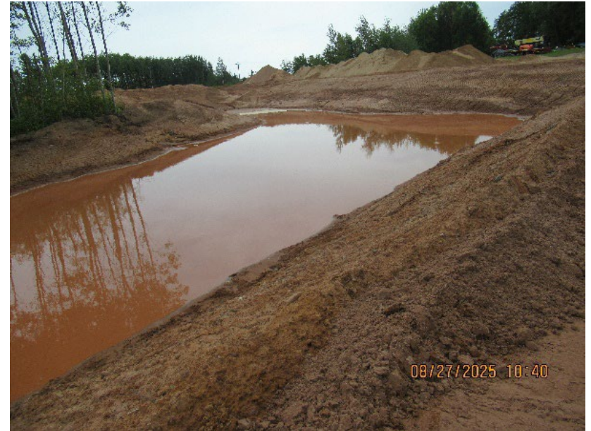
East Pond in Progress 8/27/2025