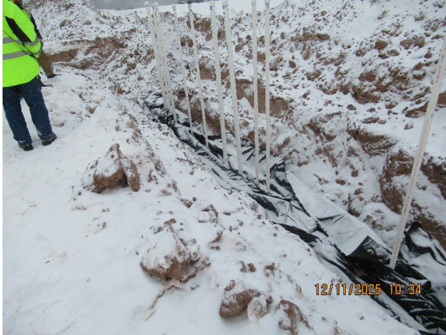
Underground Piping Installation – Neighborhood 1