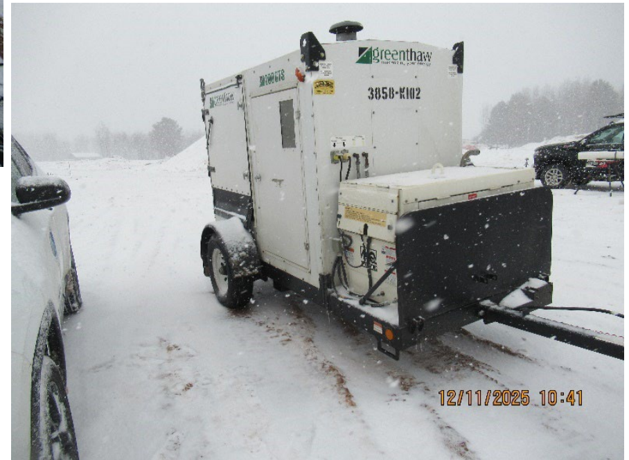
Ground Thaw Unit