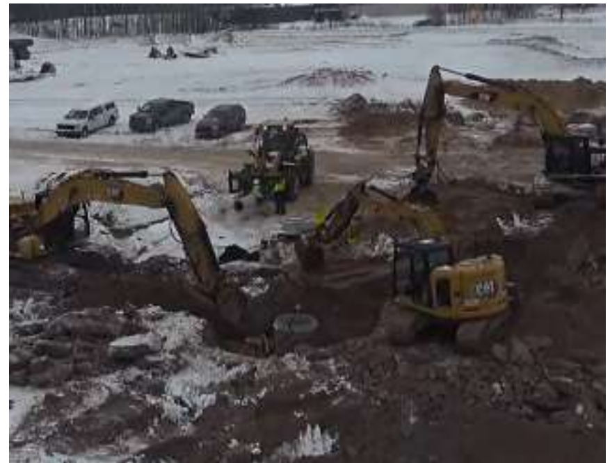
Installing Storm Pipe/Structure along Perimeter Road