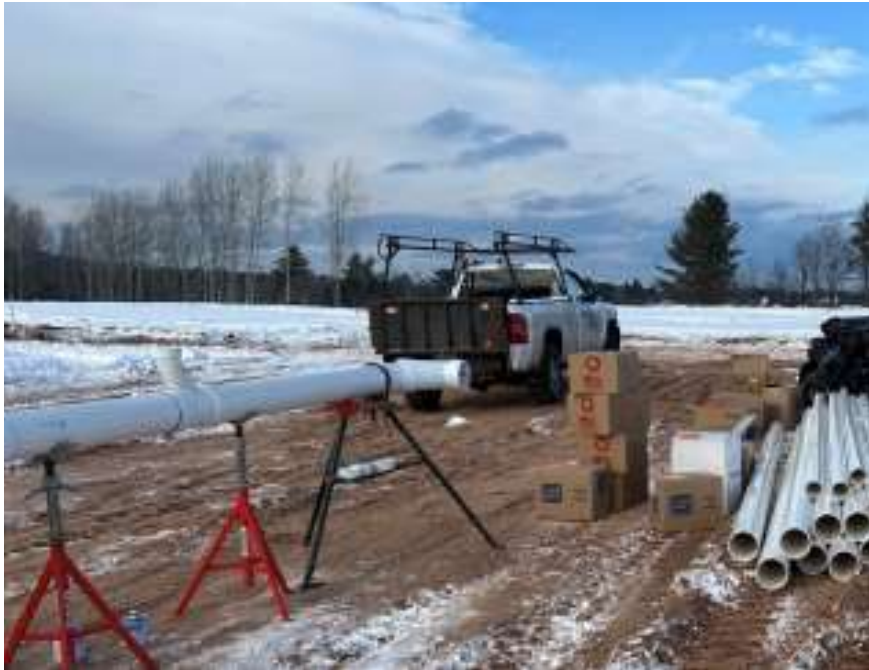
Installing Sanitary Sewer Neighborhood 1