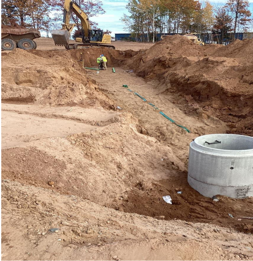
Sanitary Pipe installation 10/24/2025