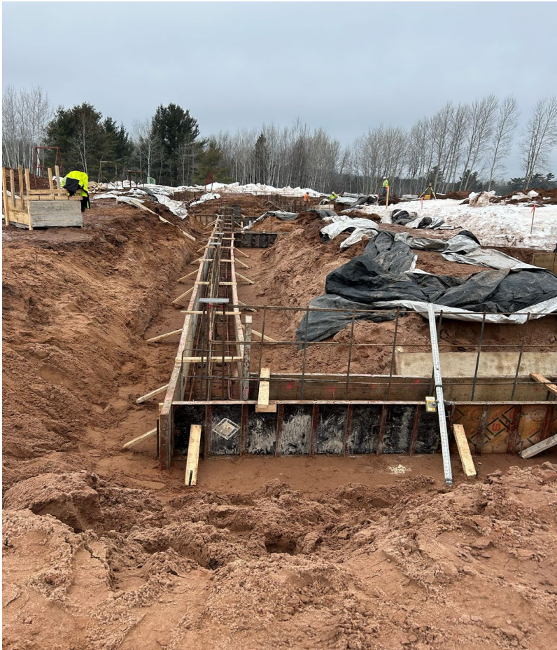
Foundation Forming 3/6/2026