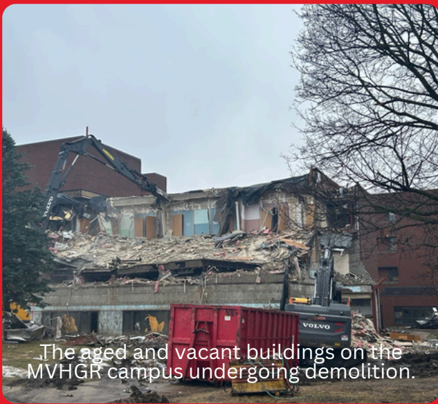
The aged and vacant buildings on the MVHGR campus undergoing demolition.

After years of being vacant, MVH received the funding to move forward with demolition of the aged infrastructure that was previously MVH at Grand Rapids. Since opening the new Home in 2021, the building became obsolete. As years of effort to repurpose and seek potential partners for the dated building yielded no success, it was determined that demolition and the expansion of greenspace on the campus was the optimal path forward. Demolition began in early 2026, and should be completed by August 2026.