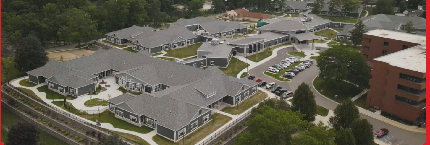
The new MVH at Grand Rapids on the left, with the aged buildings being demolished off to the right.

For 140 years, our Grand Rapids campus has adapted to meet the needs of veterans. This project represents the next chapter in our long history of evolving to serve the veterans of today - and the veterans of tomorrow.