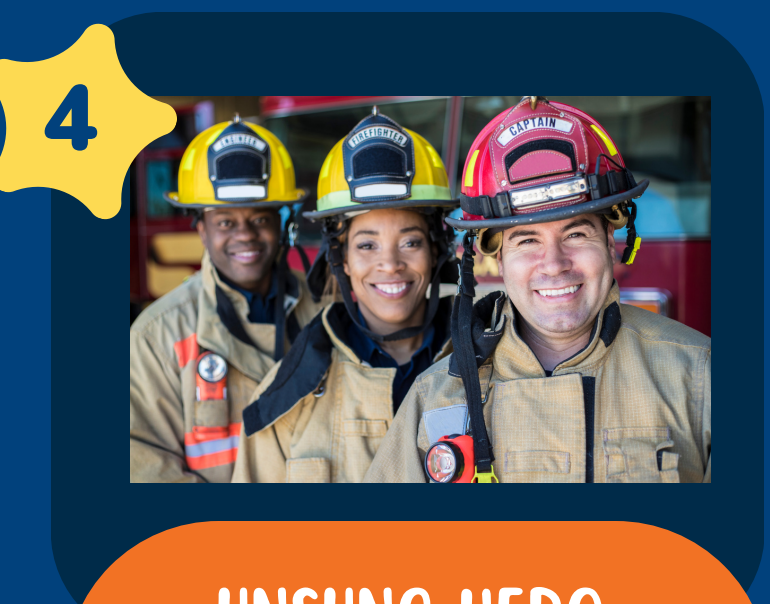
UNSUNG HERO AWARD