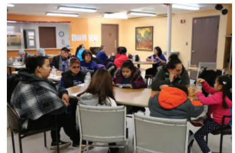
Commission meeting in Detroit.