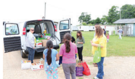
Camp visits with IMSC in western Michigan.