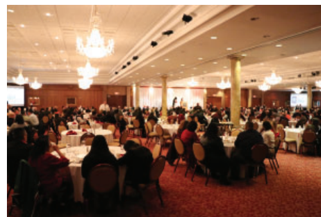
Hispanic Heritage Month Celebration in Saginaw.