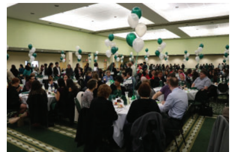
EMU César E. Chávez Celebration Luncheon