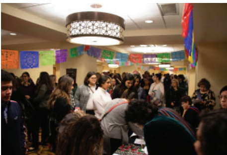
MANA de Metro Detroit Annual Brindis Luncheon.