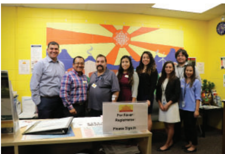
Visit to El Concilio, non-profit in Kalamazoo.