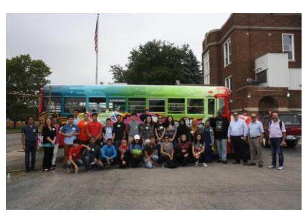
EHRA Fellows after completing an Environmental Justice tour of industry & transportation infrastructure in Dearborn, River Rouge, and SW Detroit

Most factors associated with environmental health inequities are beyond any individual's ability to control, and policy advocacy is needed to address the structural changes required to eliminate inequities, such as those experienced in Southeast Dearborn. In response the EHRA Steering Committee has designed the EHRA Academy. During summer 2018, EHRA was funded by UM-Dearborn and the Michigan Institute for Clinical and Health Research to pilot an intensive 6-session summer experience for 20 youth (16-18 yrs. old), primarily from South Dearborn. The goal was to prepare them with basic knowledge and skills in environmental health and policy advocacy, specifically related to air pollution as a community-