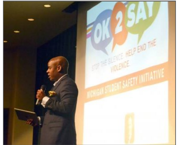
Singer and anti-bullying advocate Keenan West promotes OK2SAY.