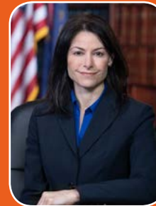
Dana Nessel Attorney General

Attorney General Consumer Programs 517-335-0855 agcp@mi.gov