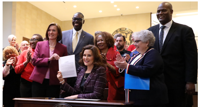
Gov. Gretchen Whitmer signed PA 4 of 2023 on March 7.

Public Act 4 of 2023 Frequently asked questions