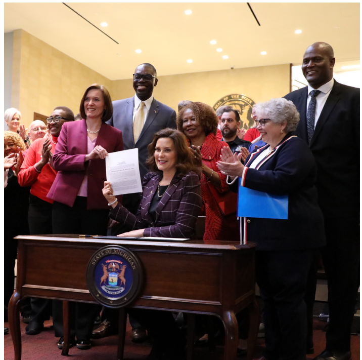
Gov. Gretchen Whitmer signed PA 4 of 2023 on March 7.

The new law also includes withdrawals from individual retirement accounts