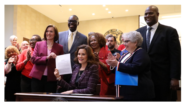
Gov. Gretchen Whitmer signed PA 4 of 2023 on March 7.

determine what changes are necessary with minimal impact to retirees.