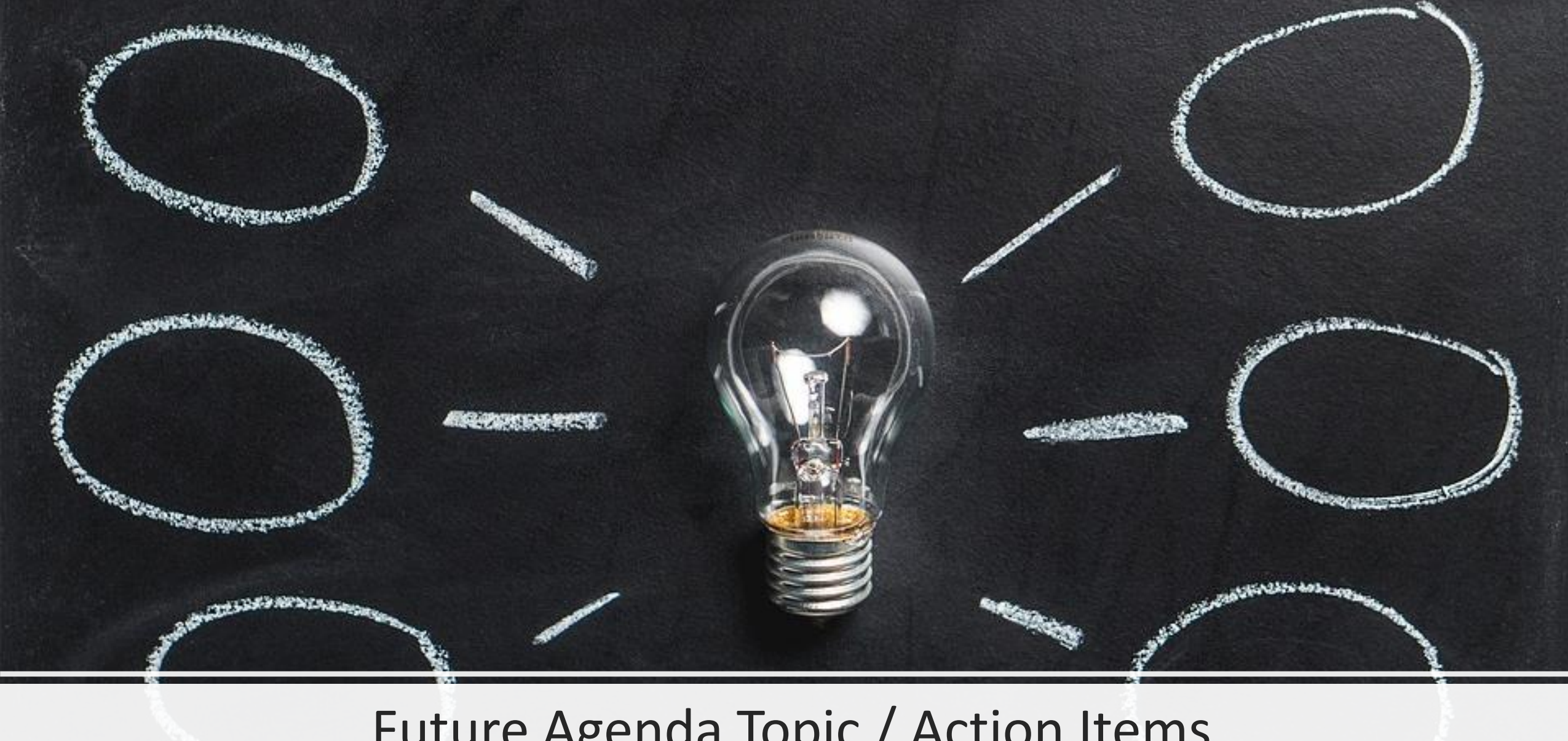
Future Agenda Topic / Action Items