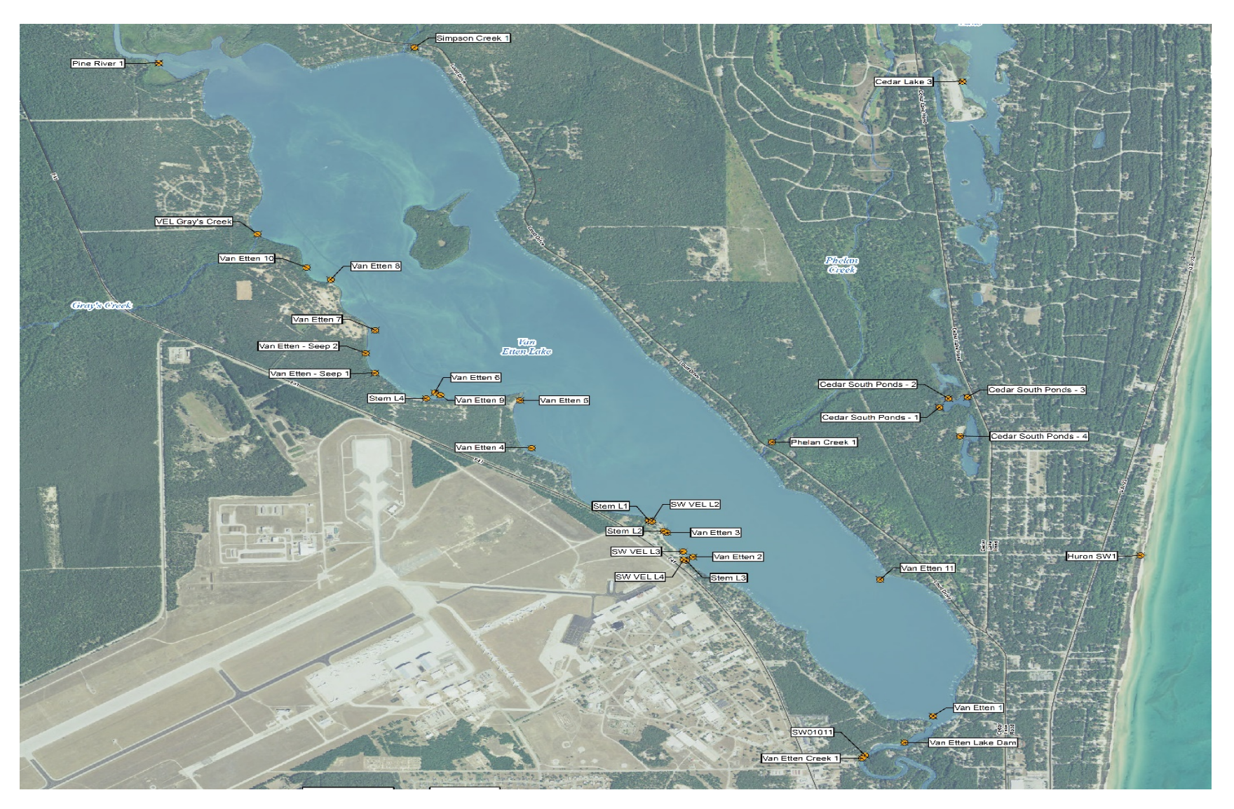
Figure 1. Surface water and seep sampling locations from Van Etten Lake, Oscoda, Michigan since 2011.