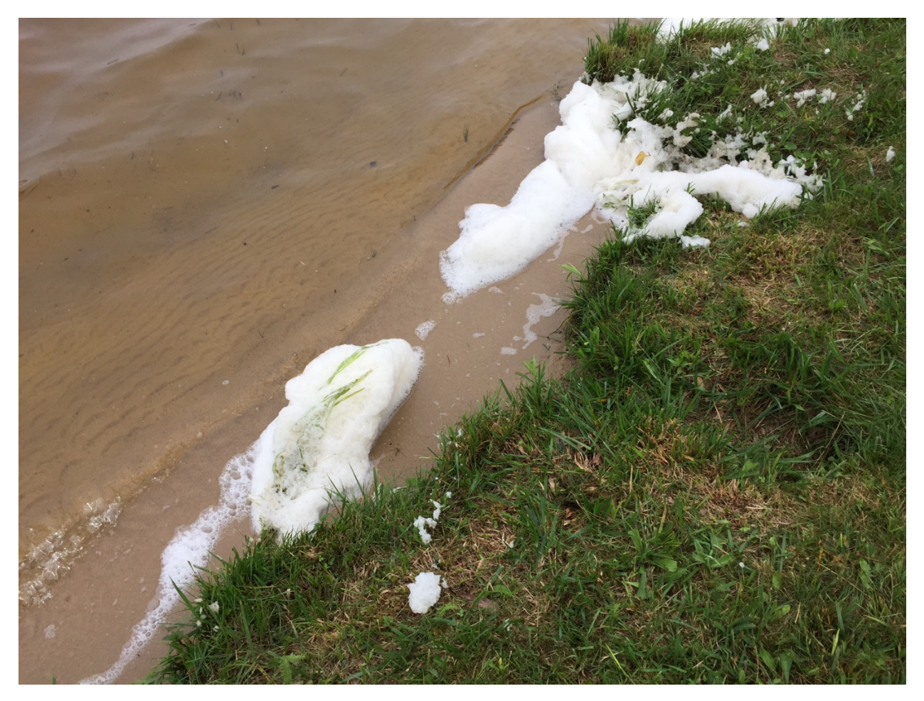
Image 1. Photo of lake foam at Van Etten Lake on Thursday, July 13, 2017. Photo taken by the EGLE during the sampling event.

Note : This is a shoreline observation that occurred during the sample collection of Van Etten Lake foam.