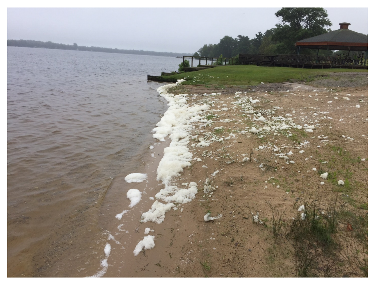
Image 2. Photo of lake foam at Van Etten Lake on Thursday, July 13, 2017.

Note : This is a shoreline observation that occurred during the sample collection of Van Etten Lake foam.