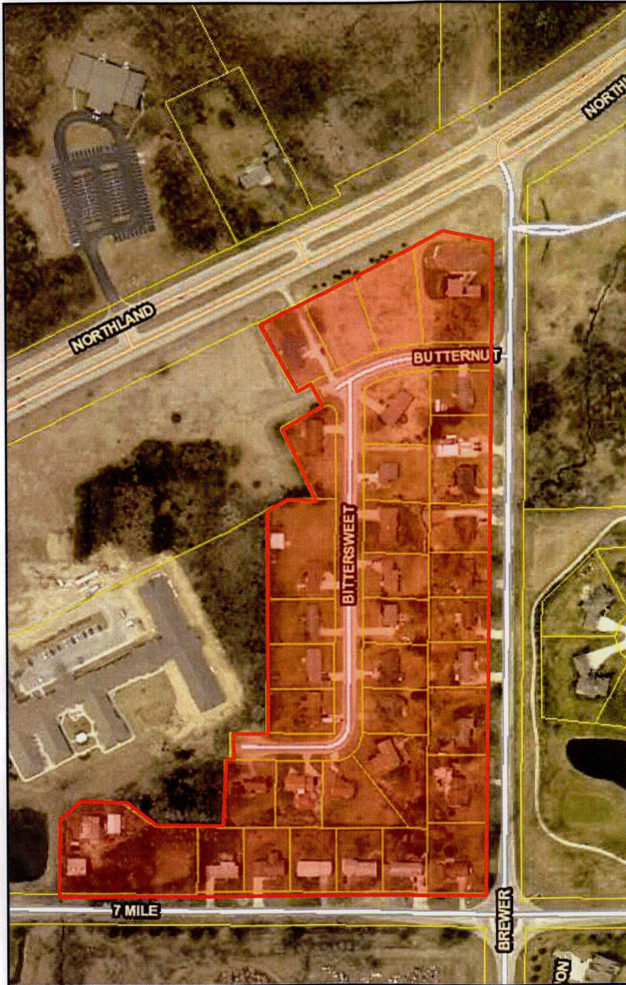
Figure 1: Bittersweet Area Parcels Plainfield Township, Michigan