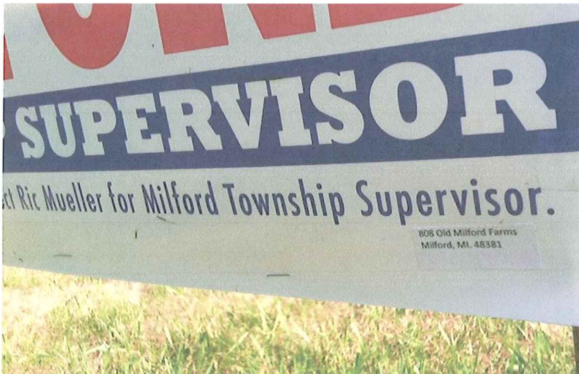
Figure A. Alterations to “Mueller for Milford” road sign to come within compliance of the Michigan Campaign Finance Act as advised by the Secretary of State