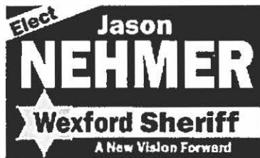
nehmer j 16x26.jpg 125K

Paid for section was asked for but not printed