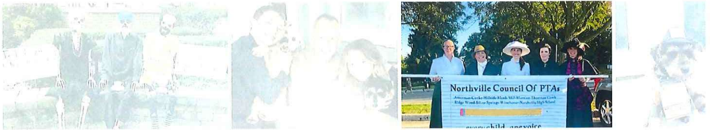
Heritage Festival Parade