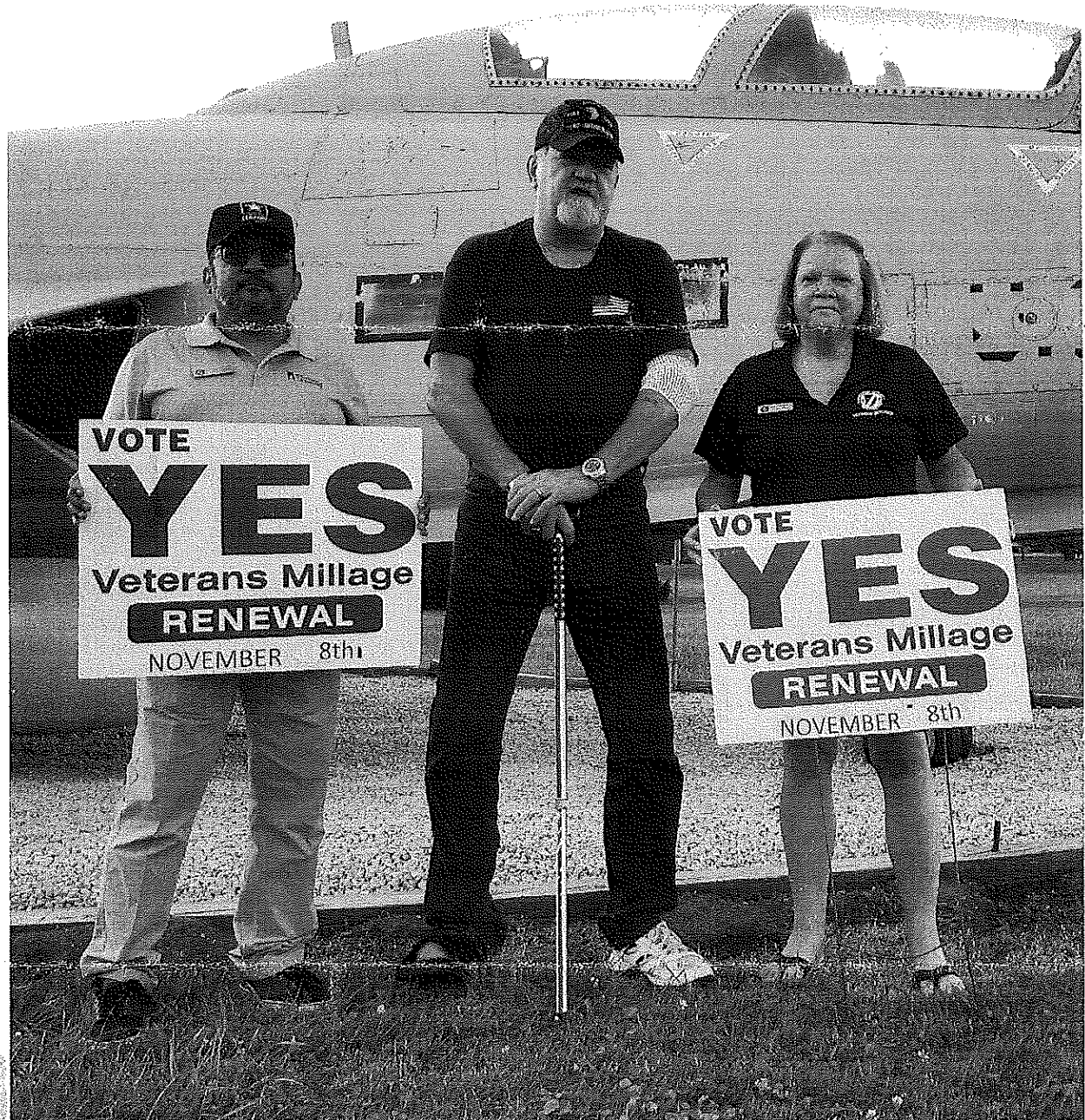
The following photo is from a Facebook post. URL: https://www.facebook.com/photo/?fbid=10159994623067733