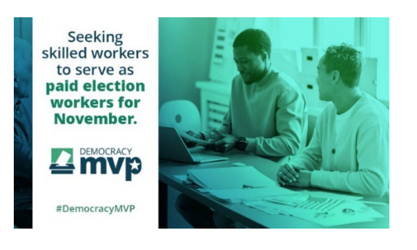
Link to download