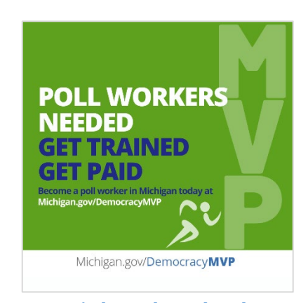
Link to download