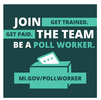
Link to download