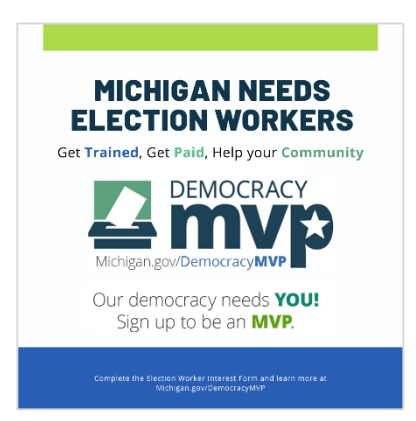
Link to download