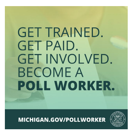
Link to download

Share the following graphics on social media. Remember to tag us @DemocracyMVP or @MichiganSoS