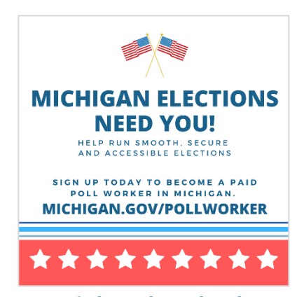
Link to download