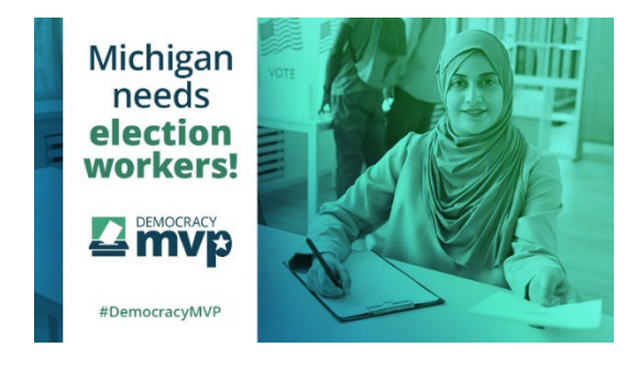
Link to download