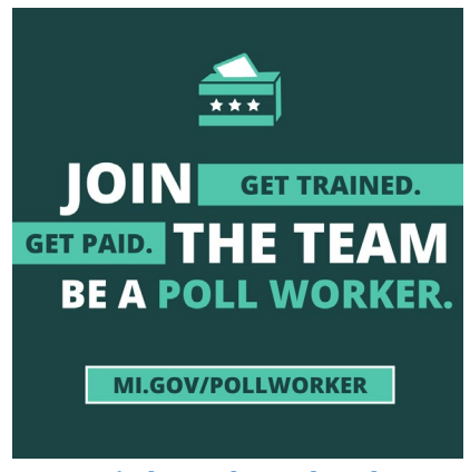
Link to download