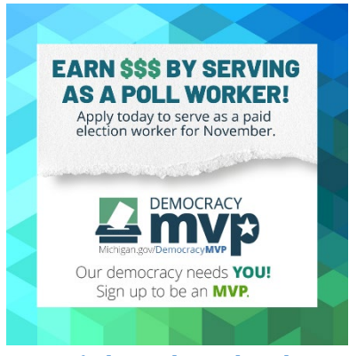
Link to download