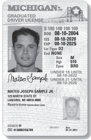
(Not shown in actual colors)

your teen's photograph will need to be retaken.